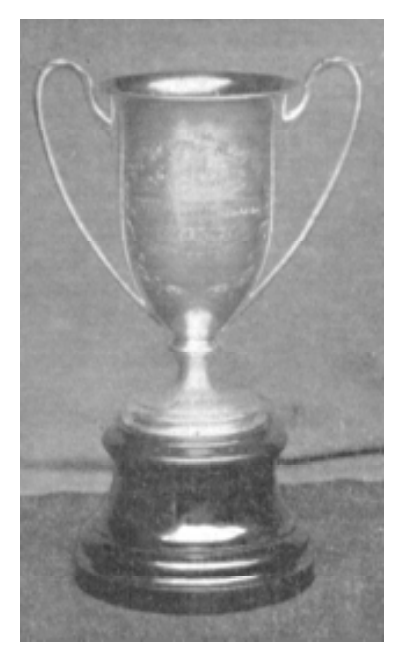
THE TREASURER'S CUP.

↑ HE Bulldog Club, Americá, held its first open bench show at the Logerot Garden, New York City, April 14th, and a very enjoyable affair it proved. A number of those most interested in the hardlooking, but really gentle dogs, attended, and the proceedings were satisfactory to all. A very pleasant feature of the event was a lunch