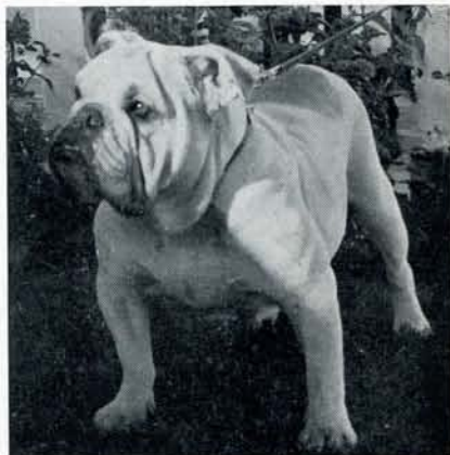
CH. YORKIST LEONORA

On Monday, the day following the show, I began to see California in grand