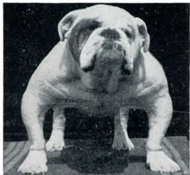
Champion Rodoco Stenter