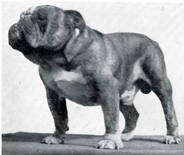
Best in Show: Specialty Show of the Bulldog Association of Southern California

Sunday, October 15th., the day of my judging assignment, dawned beautifully bright and cheerful. I had had a grand night's sleep and was bubbling over with enthusiasm to enter the ring and start judging what they told me was