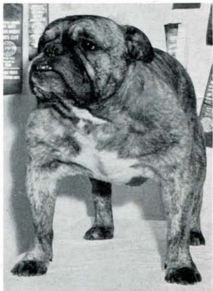
Newly crowned Champion LUMID'S TIGER