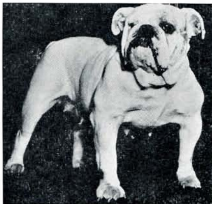
Another new Champion BASFORD BOOFULS